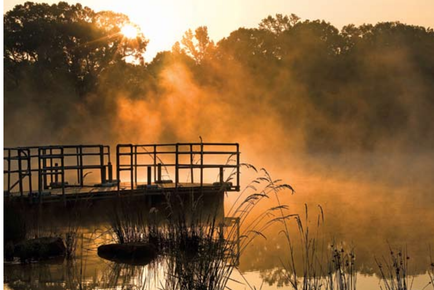
A misty morning sunrise rewards visitors to the fishing pier at Fort Boggy State Park near Centerville.

Visitors exploring the park shouldn’t expect to find remains of its namesake, Fort Boggy, a palisaded fort constructed