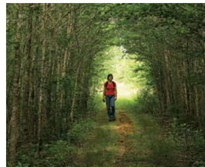
Writer Liz Carmack hikes through a Tolkienesque canopy of sweet gum trees.

I haven’t fished since I was a kid, but the relaxed expressions on the faces of two fly fishermen—who have the lake to themselves this late spring day—make me consider trading my hiking boots for a fishing pole. The men slowly float around the lake on their pedal-driven kayaks, casting in shallows along the shore and